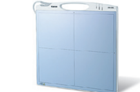
CXDI-501G Multipurpose Portable Digital Flat-Panel Detector

The lightweight and compact detector offers exceptional digital radiographic imagery, large area detection, and a detachable cable for time-effective transport and simple installation.